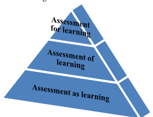
Fig.1. The Assessment Pyramid

Generally assessment can be defined in three ways, are shown in Fig.1. These are; assessment for learning, assessment of leaning and assessment as learning.